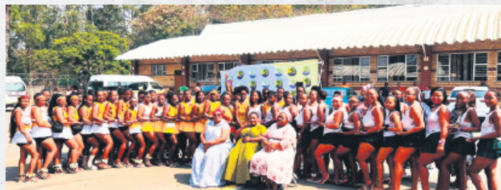
Ezinye zezintombi ezazingu 340 ezaziya eMhlangeni

Uphinde waveza ukuthi umasipala oyohleze ulweseka uhlelo lwamatshitshi aba engxenye yoMkhosi woMhlanga ngoba lokhu kutshengisa ukuthi baziphethe kahle kanti futhi baphila impilo enehloso nefuna ikusasa eliqhakazile.