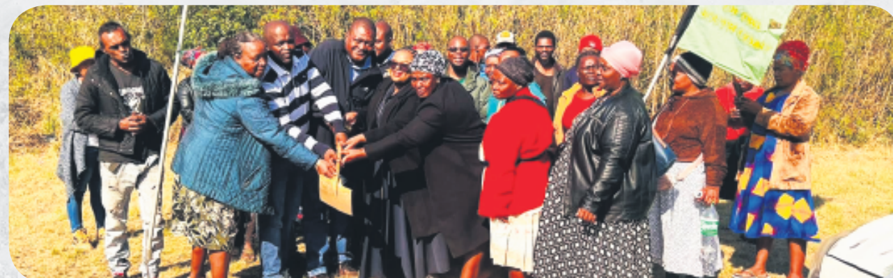
Umasipala waphendula isoyi endaweni yase Mbetheni okuwuphawu lokuqalisa uhlelo lokuxhunywwa kukagesi.

Umasipala wabe sewenza umcimbi wokuphendulwa kwesoyi ngokubambisana nobuholi balemiphakathi, okuwuphawu lokuqaliswa komsebenzi. Lephrojekthi izokwenziwa ngezigaba ezimbili. Ngokohlelo oluphasisiwe, umasipala uzoxhuma ugesi emizini engama 423 isiyonke. Kulonyaka wezimali ka 2024/25, umasipala uzoxhuma imizi engama 269 kuphela bese kuthi ngonyaka wezimali olandelayo ka 2025/26, kuphinde kuxhunywwe imizi eyi 154. "Umasipala wafaka isicelo soxhaso lwemali yokusingatha lomsebenzi kuMnyango Wezokumbiwa Namandla (Department of Minerals and Energy) wase ugonyazelwa