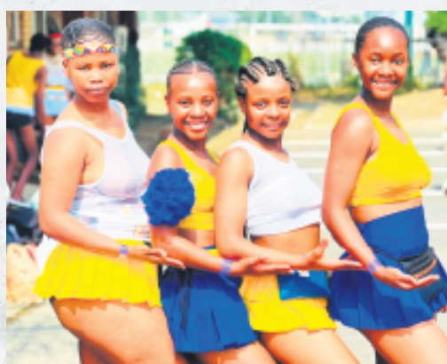
Amatshitshi aziqhenyawo ngobusulwa awo.