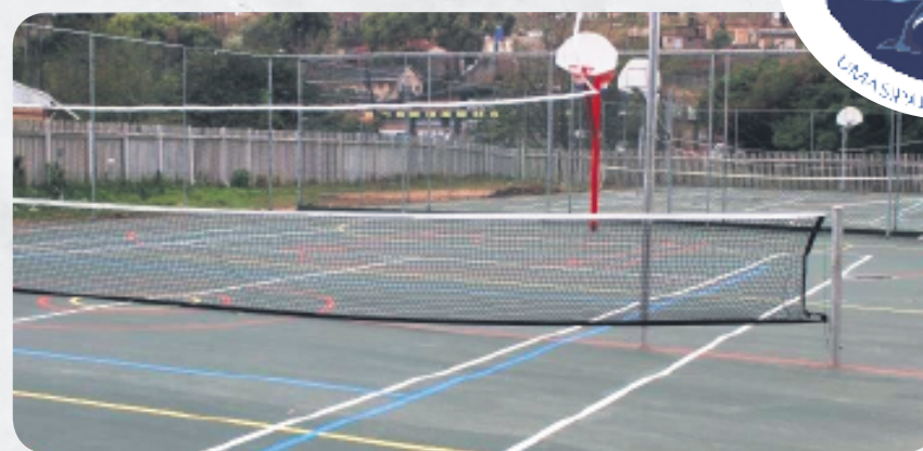
Combi Court in progress which will cater for the following sport codes; Tennis, Netball, Volleyball and Basketball.

All additions and repairs of this facility to bring it to a state of completion and be fully functional for the benefit of the Umdoni community are scheduled to be completed by end October 2024.