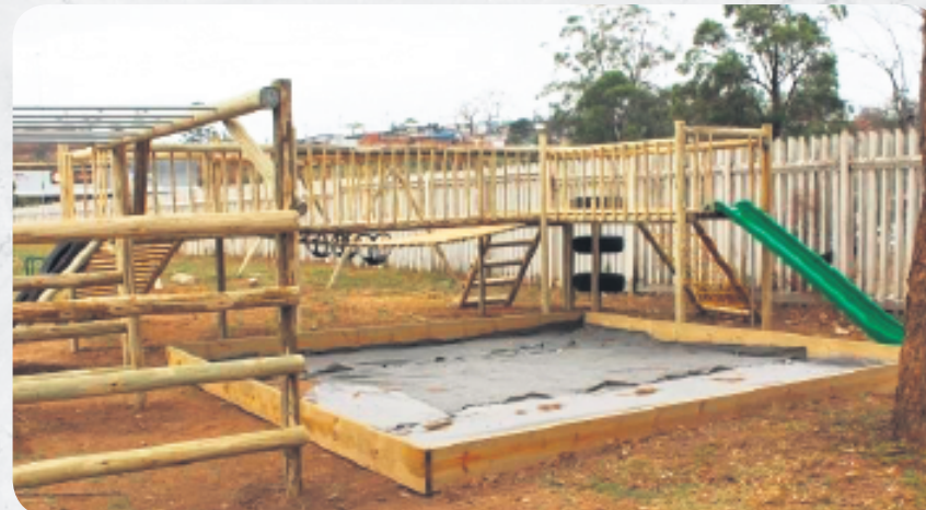
Jungle gym in progress